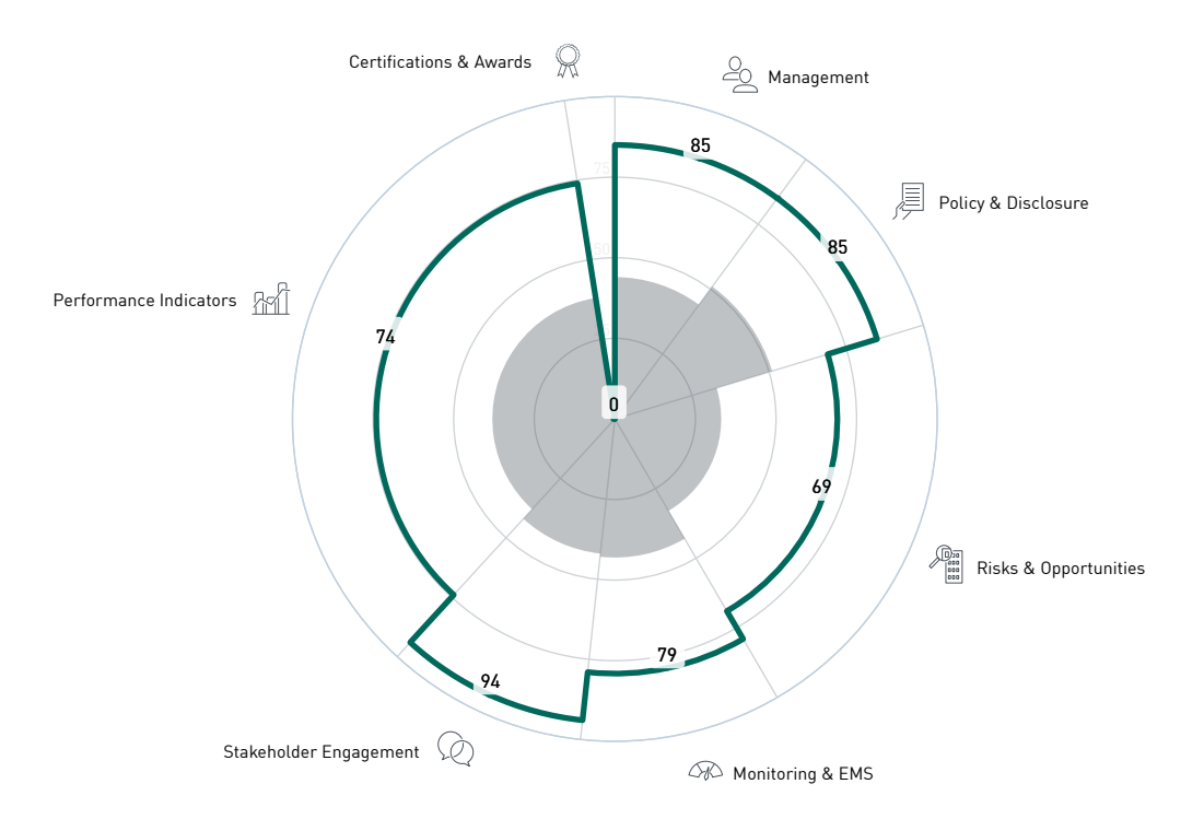
This Entity Peer Group Average